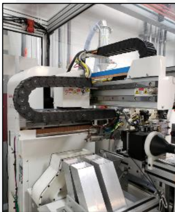
Yushin High-Speed Side Entry Robot

Matrix Tool’s engineers and designers partnered with three key suppliers to develop a state-of-the-art, high speed automation cell. We created a custom manufacturing solution consisting of Sodick’s exact dosing, 20-ton Injection Molding Machine, Yushin America’s High Speed Side Entry Robot, and a high-resolution vision inspection system from Japan. All three work in tandem to mold, remove the parts, inspect, and finally sort/separate the connectors by cavity ID. All of this occurs in a matter of seconds!